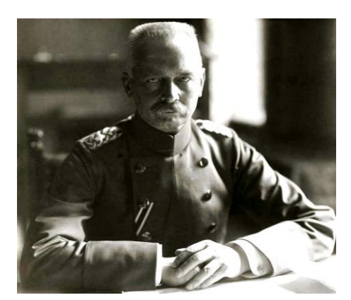
German General Staff Erich

1. The Germans wanted the Verdun to be a battle of Attrition. The morning of February 21, 1916, marked the beginning of one of the longest, bloodiest and costliest battles in World War I and history. For about 300 gruesome days, the French and German armies exchanged a brutal cycle of attacks, counterattacks and bombardments. The battle plunged the region around the Meuse River, not even 10 km radius, into what was later called the "Hell of Verdun". Hundreds of thousands of German infantries, heavy artillery, and bombardments were unleashed upon French armies positioned around forts and inside the fortified city of Verdun. Although the Germans planned for their attack to bleed France to death, the battle pulled both of them into a long and expensive impasse. By December 19th, the French were able to get the upper hand and regained their territory, but not before sustaining heavy causalities. The French and German armies suffered 800,000 men or more between them. Come and explore ten facts about the longest battle of World War I.