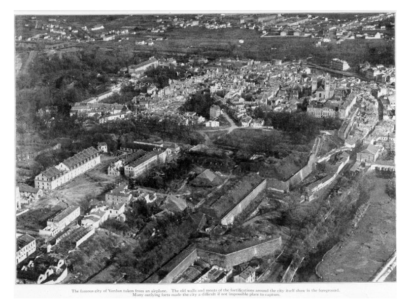
The famous city of Verdun taken from an airplane. The oak walls and moats of the fortifications around the city itself show in the foreground. Many outlying forts made the city a difficult if not impossible place to capture

2. Verdun holds a strategic and symbolic value for both sides. The Germans made Verdun their primary target not only because of its strategic position in the Western Front but also because of its historical sentiment. Verdun is situated on the river Meuse and was the northernmost fort along the French/German border that was built to keep the Germans from entering France. If Verdun fell, then Germany could easily make their way to Paris. With Verdun in place, Germany was forced to go all the way around through Belgium to get to Paris.