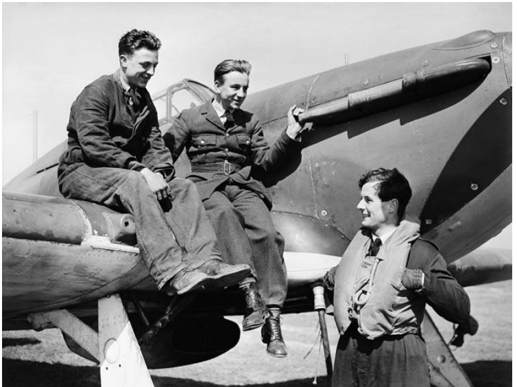
Squadron Leader Peter Townsend chats with two ground crewmen as they sit jauntily atop the wing of his Hawker Hurricane fighter based at Wick, Scotland. The Hurricane proved more effective against German bombers, while Spitfires attacked the enemy fighters during the Battle of Britain.

The difficulty in shooting down a German bomber owed to the inadequacy of the .303 round and to the self-sealing fuel tanks found in German aircraft. The self-sealing tanks worked by employing two layers of metal divided by a special rubber compound. When the tank was punctured, the fuel reacted with the rubber, causing the compound to swell and close the hole. This was only a temporary fix, which would allow the plane to return to base without losing appreciable fuel or bursting into flames.