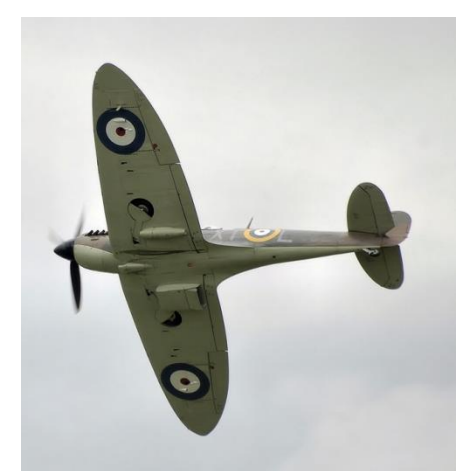
The only Supermarine Spitfire that flew during the Battle of Britain and is still airworthy today is this Mk IIA. The Spitfire became the stuff of legend during the difficult days of the Battle of Britain.

The advantage of radar combined with the excellent climbing characteristics of the Hurricane and Spitfire allowed the British the comfort of being not only in the right spot to intercept, but also at the proper altitude or, if they were lucky, higher. British response tactics were modified by Douglas Bader and Trafford Leigh-Mallory to accommodate the Big Wing theory, which inflicted heavy casualties on the Luftwaffe. Eventually this tactic was adopted as official doctrine.