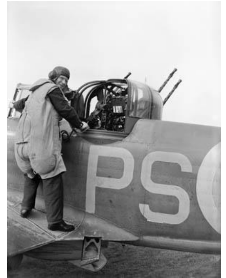
Preparing to enter the gun turret of his Boulton Paul Defiant Mark I fighter at its base at Kirton-in-Lindsey, Lincolnshire, a gunner of No. 264 Squadron, RAF, smiles confidently over his shoulder. The Defiant was obsolete by the time this photo was taken in August 1940.

The Boulton Paul Defiant first appeared in May 1940. Its top speed was 303 mph, and its four machine guns were located in a manned turret immediately aft of the cockpit. This arrangement made it impossible to attack a target in front of the aircraft, as it had no fixed forward firing armament. The turret had been placed in a defensive position.