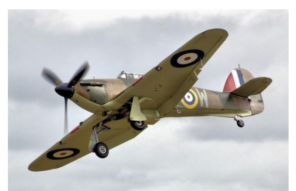
The only Hawker Hurricane from the Battle of Britain still flying today is this Mk 1, which flew 49 combat sorties from its base at Croydon, England. Its pilots destroyed three enemy aircraft and damaged two others.

The fighting did not end on September 15, although it soon became recognized as the day the Luftwaffe lost the Battle of Britain. As for Operation Sea Lion, the proposed invasion of Britain, Hitler postponed it indefinitely. London would suffer from the Blitz as bombing raids continued throughout October. Historians often cite October 31 as the date on which the actual Battle of Britain concluded. RAF losses were 1,017 planes and 537 pilots in Fighter Command and 248 planes and nearly 1,000 men from Bomber and Coastal Commands. The Luftwaffe lost 1,733 planes and nearly 3,000 crewmen.