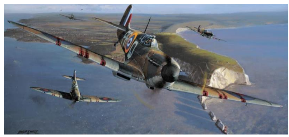
The British Royal Air Force saved its island nation from invasion during the dark days of 1940 and the Battle of Britain.

It was a battle fought without armies. No rifles, no tanks, no barbed wire. In the summer of 1940, the skies above Britain served as the battlefield for the British Royal Air Force and the German Luftwaffe. The Nazis had conquered most of Western Europe, and Britain stood alone. The Luftwaffe represented the first arm of the German military juggernaut to take a swing at the British Isles. Its mission was simple: repeat the performances in Poland and France and eliminate the enemy air force. This would facilitate an invasion, which the Germans had no reason to believe would fail.