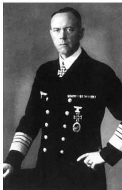
Bismarck's captain, Admiral Günther Lütjens, went down with the ship after it was attacked and sunk on May 27, 1941

Admiral Lütjens was surprised to see Prince of Wales turn away, but he dismissed calls from some of his men to pursue the British ship. It was doubtful they would be able to catch her. Also, Bismarck herself had been hit. Two shells had caused minor damage. However, one 14-inch shell had struck below the waterline causing some flooding and reduction in speed. Worse, some fuel tanks had been ruptured causing the loss of several hundred tons of precious fuel oil. Lütjens soon realized he could not continue with the mission to attack British convoys due to the loss of fuel. Prinz Eugen was therefore detached to proceed with raiding while Bismarck turned back. The battleship headed for the nearest port with a drydock big enough to take Bismarck , at St. Nazaire , France.