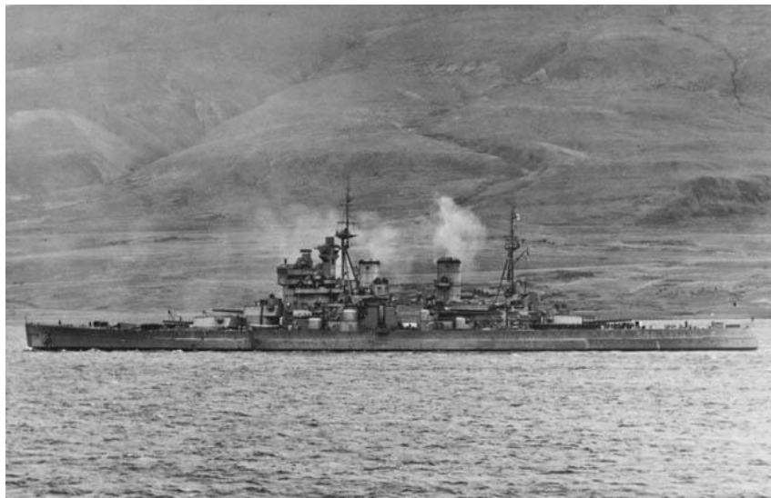
Photo taken from Prinz Eugen shows Bismarck firing on HMS Prince of Wales . The British ship was hit and badly damaged but did not sink.

After the loss of the Hood , the battle continued. Prince of Wales was about 1,000 yards astern of Hood . Seeing the flagship explode, Captain Leach ordered a hard turn to starboard to avoid the wreckage. Hood was engulfed in smoke, but the stern was still above the water. The forward section still had some momentum but was listing to port and sinking rapidly. After clearing the wreckage, Leach swung Prince of Wales back onto 260 degrees, bringing his full broadside to bear.