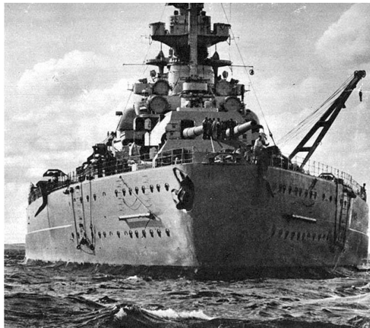
Bismarck , pride of the German Navy, shown during sea trials, March 1941.

Prinz Eugen had already picked up the sound of ships with her underwater detection gear at some 20 miles to the southeast. At about the same time as the British lookouts spotted them, the Germans spotted smoke on the horizon. Lütjens believed that these were likely more cruisers, and he was under orders to avoid contact with British warships. He turned to starboard and headed almost due west, confident that he could outrun them.