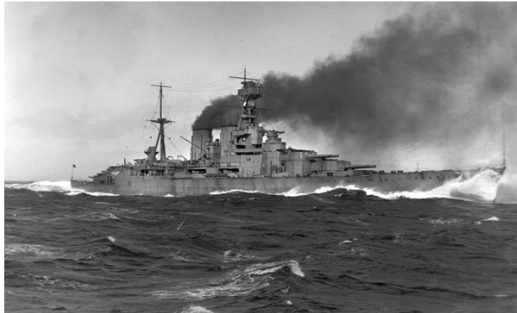
The battlecruiser HMS Hood, launched in 1918.

On May 21, 1941, Hood and Prince of Wales left Scapa Flow with six destroyers under the command of Admiral Lancelot Holland flying his flag in Hood, their mission to provide heavy support to the cruisers Suffolk and Norfolk covering the Denmark Strait between Greenland and Iceland—one of the likely routes the German naval squadron would take to reach the North Atlantic. The rest of the fleet was gathering to cover the area between Iceland and the Orkney Islands.