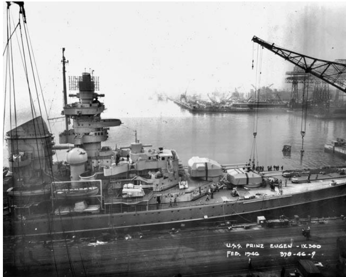
Prinz Eugen accompanied Bismarck during their breakout into the North Atlantic. After surviving the war, Prinz Eugen was turned over to the U.S. Navy and sunk in 1946 during atomic-bomb testing at Bikini Atoll

am on May 27, 1941, the German battleship sank some 300 nautical miles west of Ushant, France. Only 110 of her crew of 2,222 survived the sinking. Admiral Lütjens went down with the ship.