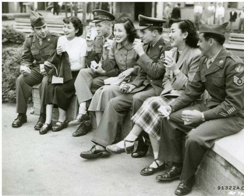
After World War II, tens of thousands of Japanese women moved with their new husbands, American soldiers, and assimilated into American culture.