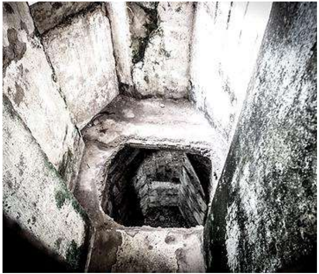
The underground tunnel the POWs were forced into

through their failure to take command responsibility. Thus, most of the accused Japanese had very little direct involvement with the atrocities perpetrated at Puerto Princesa. However, due to the chain of command, they were deemed responsible. Their attitude was described as callous indifference to the fate of the prisoners in their hands.