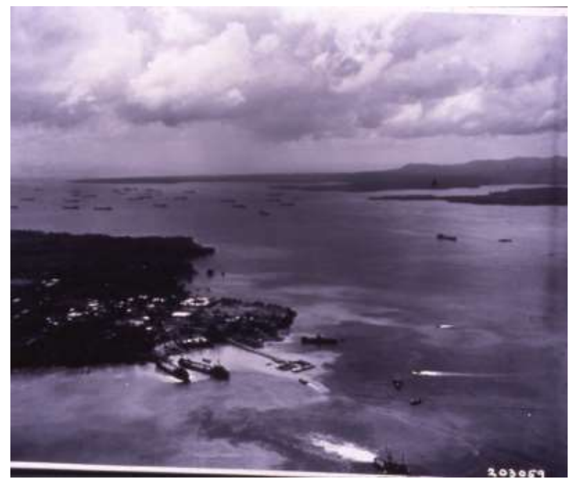
Puerto Princesa, Palawan Island in the Philippines

With the stunning defeats suffered by the United States, Great Britain and the Netherlands in the early months of the Pacific War, thousands of Allied military personnel became prisoners of the Japanese. The Americans captured in the Philippines were initially detained in filthy, overcrowded POW camps near Manila, but eventually most were shipped to other parts of the Japanese empire as slave laborers.