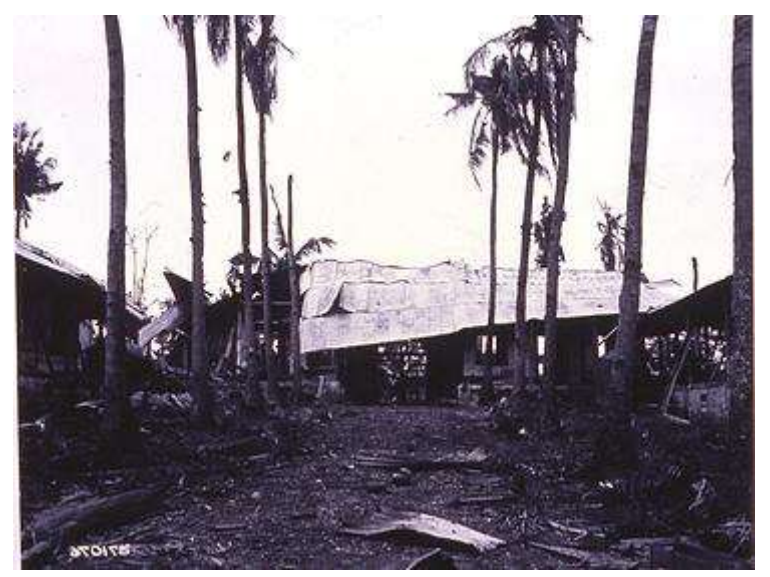
The coconut trees in the camp where prisoners were tied and tortured

forced to stand at attention while a guard beat them unconscious, after which the prisoners were revived to undergo further beatings. A Japanese private named Nishitani punished two Americans, who were caught taking green papayas from a tree in the compound, by breaking their left arms with an iron bar.