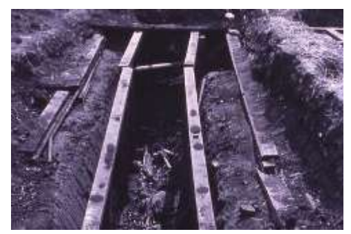
The hole where the American prisoners of war were forced to get into before they were dowsed in gasoline and burned alive inside the narrow tunnel

About 30 to 40 Americans escaped from the massacre area, either through the double-woven, 6-foot-high barbed-wire fence or under it, where some secret escape routes had been concealed for use in an emergency. They fell and/or jumped down the cliff above the beach area, seeking hiding places among the rocks and foliage. Eugene Marine Sergeant Douglas Bogue recalled: "Maybe 30 or 40 were successful in getting through the fence down to the water's edge. Of these, several attempted to swim across Puerto Princesa's bay immediately, but were shot in the water. I took refuge in a small crack among the rocks, where I remained, all the time hearing the butchery going on above. They even resorted to using dynamite in forcing some of the men from their shelters. I knew [that] as soon as it was over up above they would be down probing among the rocks, spotting us and shooting us". "The stench of burning flesh was strong. Shortly after this they were moving in groups among the rocks dragging the Americans out and murdering them as they found them. By the grace of God I was overlooked".