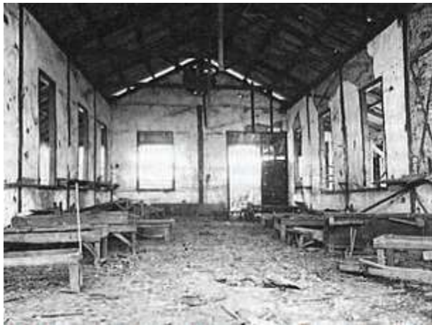
The Palawan warehouse where the POWs slept anywhere...empty after the massacre