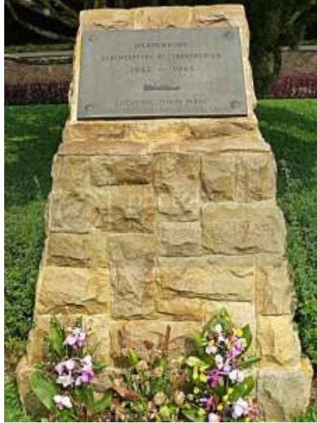
The Junyo Maru Commemorative Plaque at Ereveld Leuwigadjah, Tjimah