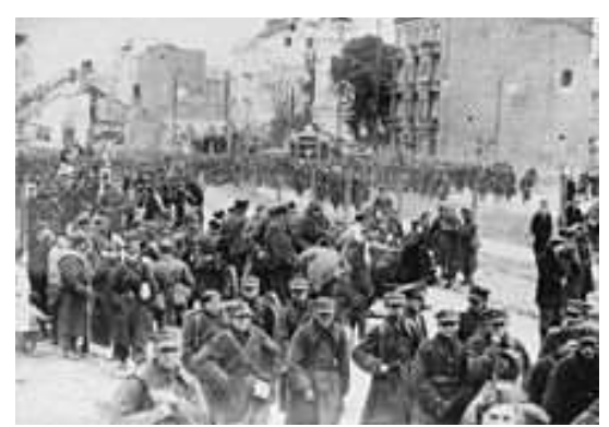
Polish soldiers march into German captivity on 30 September, following the capitulation

Several of the Polish units declined to put down their weapons and stop firing, and their commanding officers had to be visited by Generals Czuma and Rommel personally. Many units chose to hide or destroy their heavy armament rather than surrender it. The few remaining 7-TP tanks were destroyed by their crews. (Some of the hidden war material would later be used during the Warsaw Uprising of August 1944). At 6 p.m. on 29 SEP the evacuation of Polish forces to German prisoner of war camps started. It continued all day on the 30th. The following day, 1 OCT, German units entered the city. The battle for Warsaw was over.