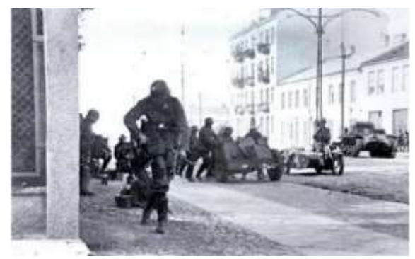
German tanks and motorized shooters on Grójecka str. between Siewierska str. and Przemyska str. PzKpfw I tank and a 7.5 cm le.IG 18 gun are visible.

Meanwhile, everything was being readied for the final German assault on the besieged city. By now the forces surrounding Warsaw numbered eight divisions and some 175,000 soldiers. The plan was for a concentric attack by all divisions, with the main attack to be delivered by those of the XI. and XIII. Armeekorps from the west. On 24 SEP, all German units, including those of the I. and II. Armeekorps of the 3. Armee east of the Vistula, were put under command of Blaskowitz's 8. Armee, this to ensure good co-ordination in the forthcoming assault. Generalmajor Wolfram von Richthofen, the Fliegerführer z. b. V. in Luftflotte 4 (responsible for co-ordinating Stuka and other close-support operations), was put in overall command of the air formations deployed in the attack.