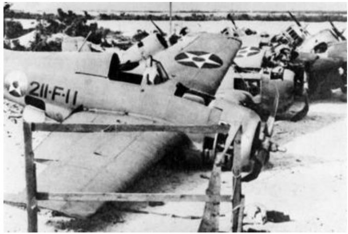
Destroyed F4F Wildcats on Wake Island, December 1941.

By the 21st, the last of the Wildcats had been destroyed in dogfights over the atoll. With nothing left to fly, Putnam's aviators were assigned duty as riflemen. Japanese airplanes now roamed over the island at will, pounding American positions in preparation for a renewed attempt to seize the atoll.