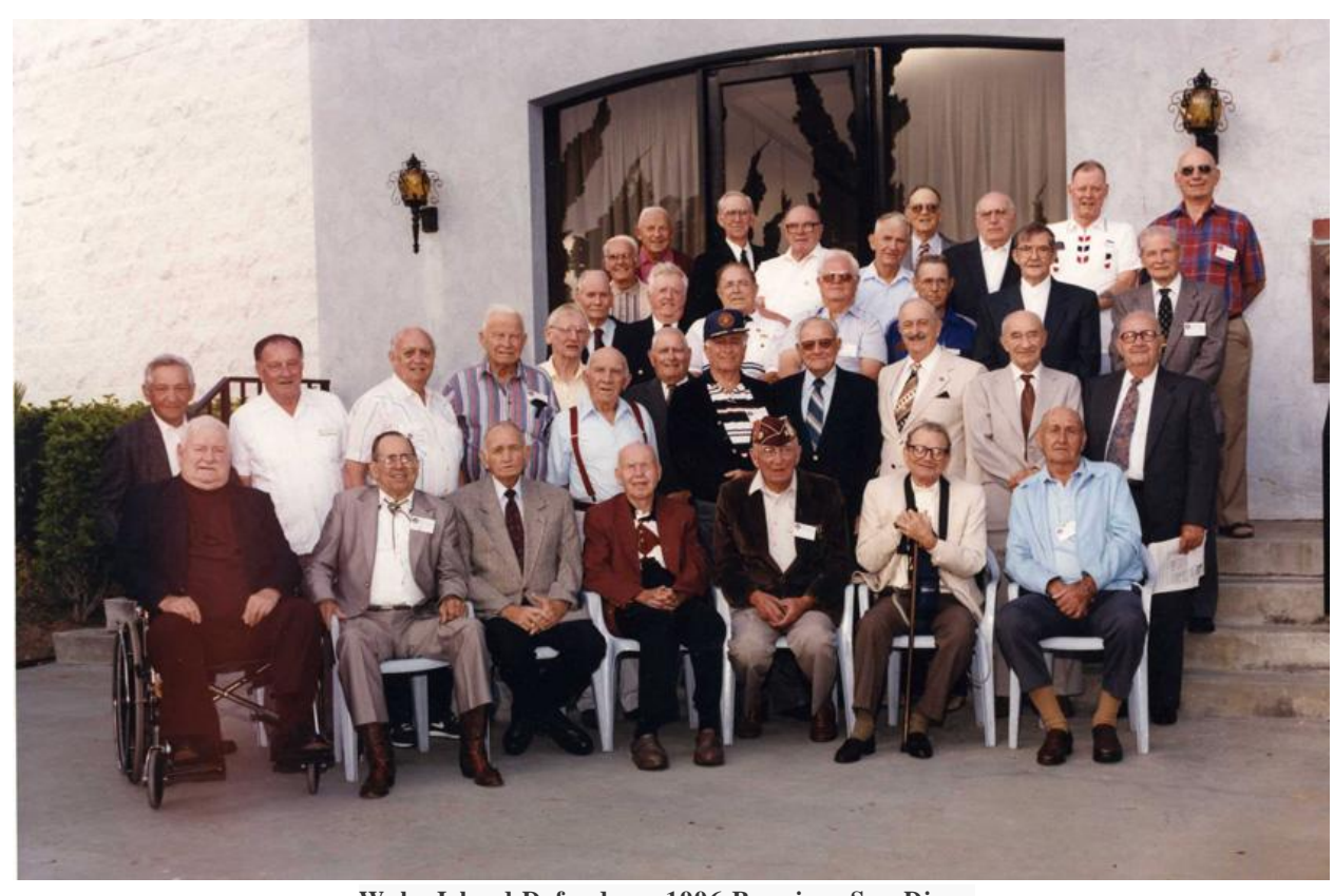
Wake Island Defenders- 1996 Reunion, San Diego