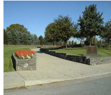
Maryland Vietnam Veterans Memorial