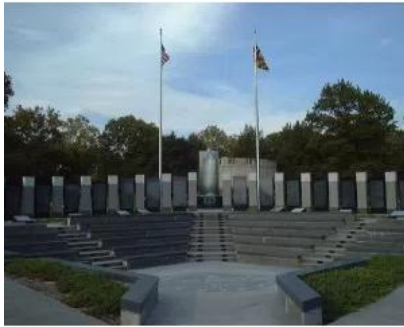
Maryland World War II Memorial