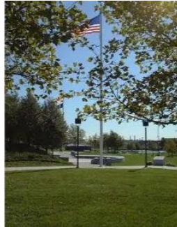
Korean War Memorial