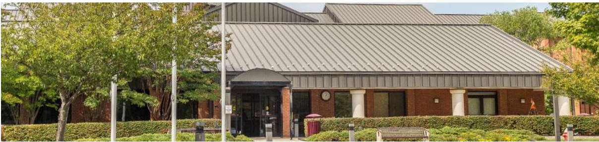
Charlotte Hall Veterans Home 29449 Charlotte Hall Road, Charlotte Hall, MD 20622