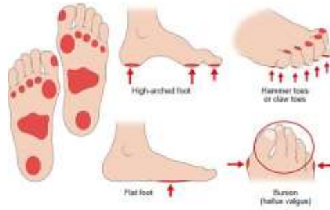
Areas that are particularly prone to diabetic foot ulcers

What are the signs of diabetic foot problems? The signs of diabetic foot problems differ depending on whether they are mainly caused by nerve damage or blood vessel damage.