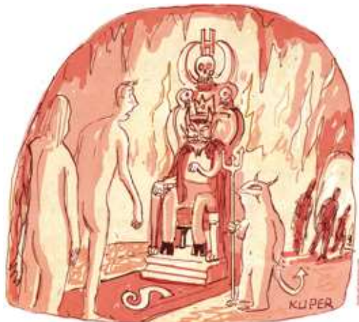
"What happens if I don't fist bump?"