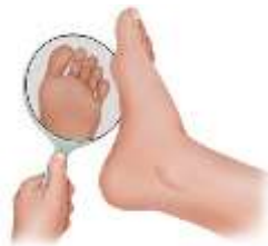
Checking your feet with the help of a hand mirror

How can long-term foot damage be prevented? There are a number of things you can do to make sure your feet stay healthy despite having diabetes. The main ones are: